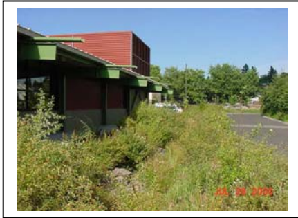
7. Vegetative Filter (Portland)