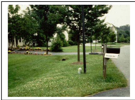
9. Grass Swale