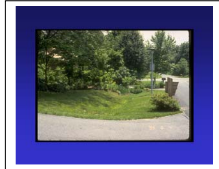
8. Dry Swale (Montgomery County, MD)