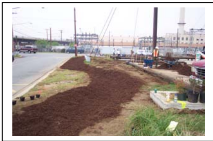
11. Linear bioretention (PEPCO -Benning Service Center)