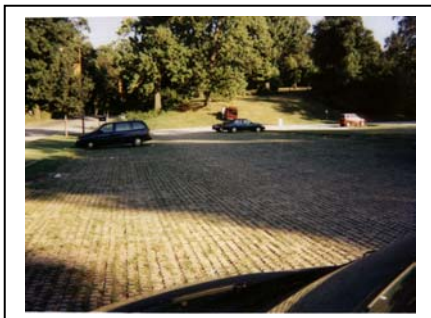
13. Porous / Permeable pavement (Baltimore Zoo Parking Lot)