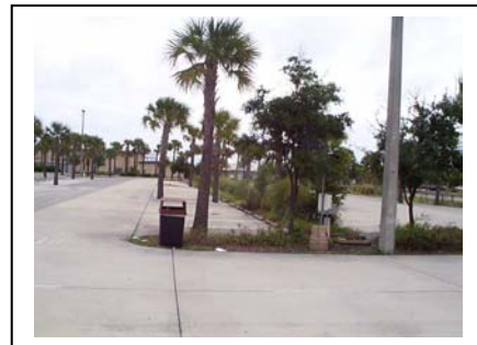
12. Parking Lot Filter (Tampa Bay Aquarium)