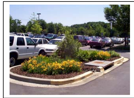
10. Bioretention / Rain Garden (P.G. County Office Complex)